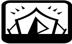
4th Thurs Picnics May - August in big tent. Entre' provided: $ donation. Bring dish to pass / table service