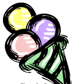
Ice Cream Socials 7/3 C&S @ St. Dance 8/5 C&S Cones @ Fun Day 9/3 after Gospel Concert