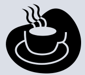
Coffee Hour 8:30 am Saturdays Sweetwater Doughnuts