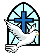
Sunday Services 6:30 pm 2nd Sun: Jan - May Summer Services 6/11, 6/25, 7/23, 8/6, 8/20 Gospel Concerts 5/28, 7/9, 9/3