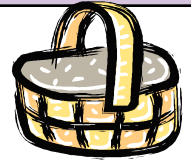
*C&S Dinners* Buy tickets in advance 5/11, 6/8, 7/13, 8/10, 9/14