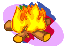
Campfires 5/27, 6/24, 8/12