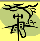
Tornado Siren Test 1st Sat. @ 12:05pm March - October