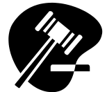
Carers & Sharers Board Meetings 1st Thurs 7pm May - Sept General Meetings 2nd Thur after potluck May - Sept Elections on 9/14